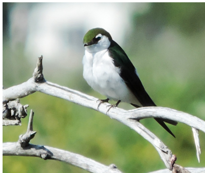
Violet-green Swallow - Ellen Reintjes