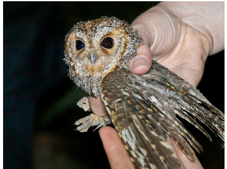
Flammulated Owl (male)