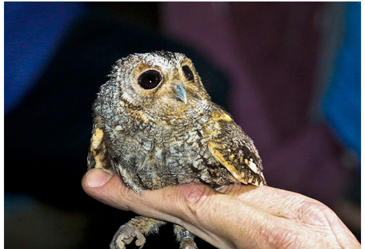
Flammulated Owl (fem) ready for banding